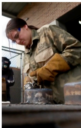
This month, CBS Evening News spotlighted a powerful example of rural collaboration in action: the Rural Schools Innovation Zone (RSIZ) in South Texas.

That's why we did a deeper dive on the data and how the Texas Legislature is acting now to equip high school students with the skills and credentials they need to thrive in a changing economy.