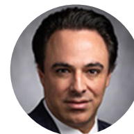
Rep. Canales Joint Author