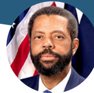
Sen. Miles Coauthor