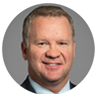
Rep. Cook House Author