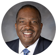
Sen. West Senate Author