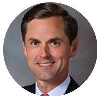
Sen. Middleton Coauthor