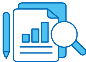
Current end-of-year STAAR

This school year, Texas is entering its 3rd year of the TTAP, which is exploring replacing the single end-of-year summative test with shorter, adaptive interim tests administered throughout the school year to produce a summative score. Almost 100 school systems are participating in the pilot. Initial pilot findings underscore the value of multiple opportunities for students to demonstrate understanding, highlight the importance of ensuring assessment data is meaningfully utilized by parents and teachers to better support students, and provide insights into evolutions in the testing experience to apply more broadly.