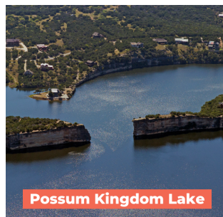
Possum Kingdom Lake

Acre feet of water lost annually due to leaky pipes across Texas.